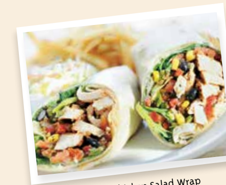
Santa Fe Chicken Salad Wrap

FRESH GOURMET COOKIE PLATTER ..... $14.00