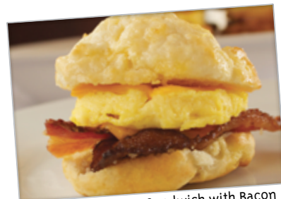
All-American Egg Sandwich with Bacon

Bacon ..... $3.00 Grits ..... $1.50 Sausage Gravy ..... $2.25